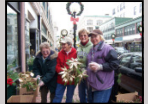
GNB Garden Club & Pride on Purchase St. Committee